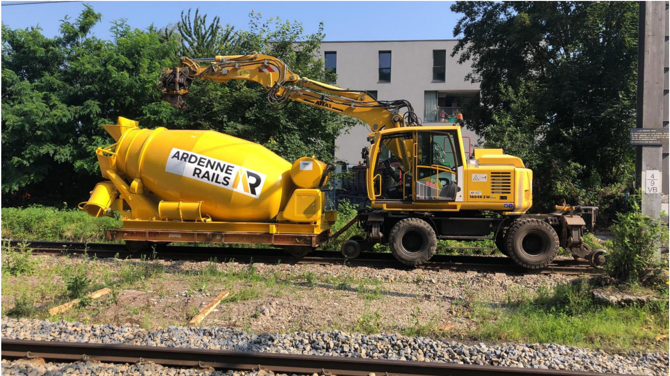
Concrete Mixer for use in tunnel